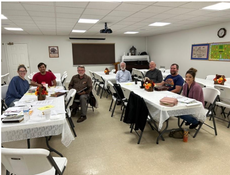
Above: A photo of the group currently enrolled in the Ministerial Training Program in the Central Allegheny Region

For additional and more detailed information regarding the Covenant Brethren Church Ministry Training Program, please join us at: https://covenantbrethren.org/training/